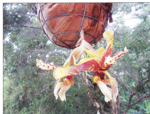
Stanhopea nigroviolacea, or Upside Down Orchid

Visitors & new members are always welcome. For more information, contact the Circle's Publicity Officer on 9481 8895.